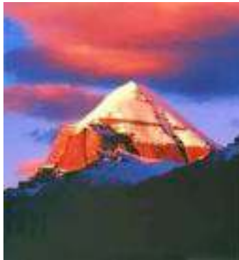
Cosmic Mt. Neru/ Mt. Kailash

The Crystalline City which is most active now is the city at the lake known as Atitlan in the America's of Central. This is a most active energy now because it is a synthesis, it is a representation of many energies. And the cosmic energy that exists above, as we would offer to you, Mt. Neru that is streaming in through this cosmic connection to you today, is also here to assist many to shatter the illusion of single-life focus.